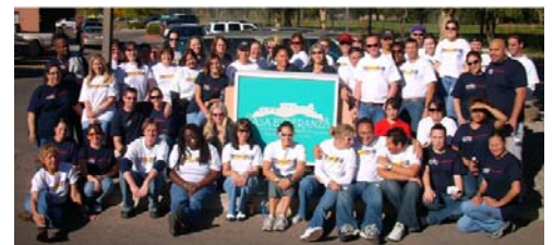
Volunteers from The Simpson Property Group & CitiCards came out in force on Make A Difference Day.

Nearly every week of the year we have volunteers in the house and this newsletter is about just a few of them. I hope that you or your group will be interested in volunteering and will contact me at 505-277-9880 or amedina@casaesperanzanm.org .