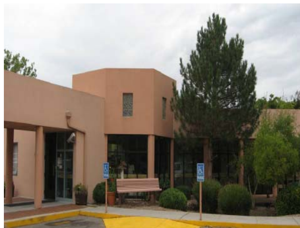
Casa Esperanza 2007

Providing services is what we are about, yet the most fulfilling part of my volunteer experience as a Board Member is when we receive letters from former residents about how Casa has touched their lives. Instead of giving you